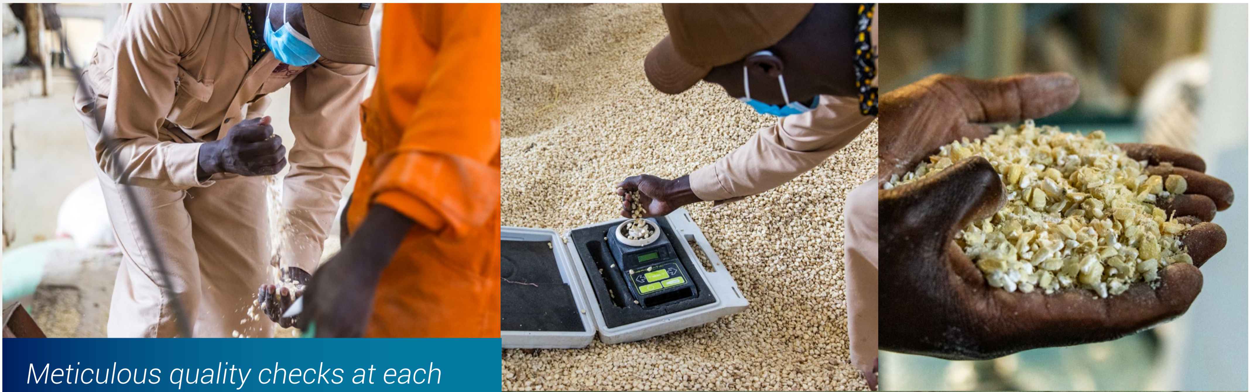
Meticulous quality checks at each stage of the production process.

Buffalo Millers is a market-focused, customer-oriented group with a dedicated and hard-working team of well-trained staff – from procurement to flour milling, product development, quality control and sales. This dedication and focus has enabled Evans Killy and his team to leave a positive imprint on the market.